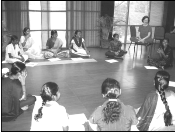
Children from an orphanage in Chennai receiving EMDR as part of the Cerner-sponsored training.