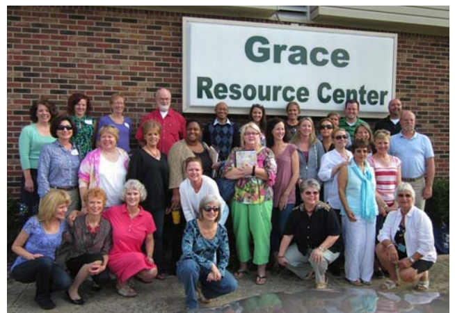
High Point NC team and trainees August 2010