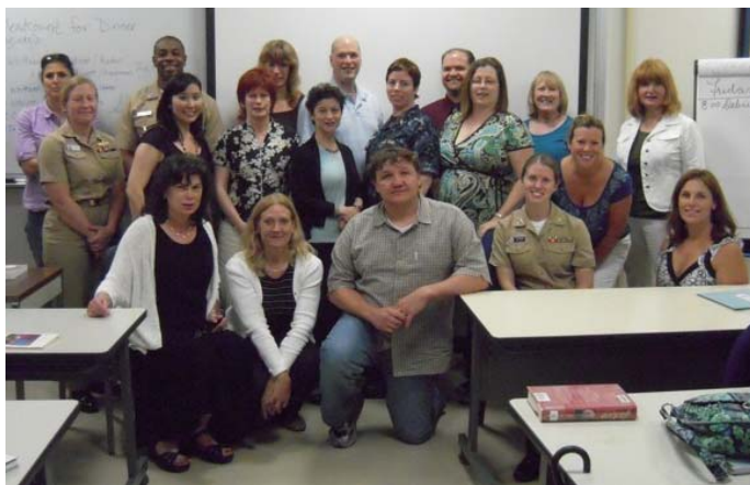
Japan team and trainees July 2010

As we continue to revise our website and our brochures, we would love to have more photos from HAP events. For example, it would be awesome to get group shots of new trainees posed in front of their agency's sign, or candid pictures of the training team working together or sharing a meal. Next time you attend a HAP training, please take some pictures and send them to me at conrads@emdrhap.org . Thanks!