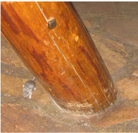
...this wee mousy was an unanticipated roommate!